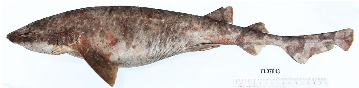
Fig. 1. Fresh specimen of Cephaloscyllium pictum Last, Séret & White, 2008, Fi.07843

Colour pattern: upper half of body is very dark, with a weak variegated pattern of spots and blotches, no saddles or are barely detectable; dorsal fins are mostly dark variegated; large, blackish blotch found over the gills; posterior margin of terminal lobe of caudal fin with dark, anteriorly directed, v-shaped marking; upper surface of pelvic fin with a well-defined, blackish median blotch; without dark saddle extending onto caudal peduncle above the origin of ventral lobe of caudal fin (Fig. 1).